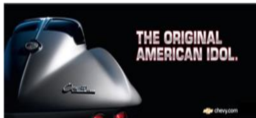
Chevrolet trademark(s) used with the written permission of General Motors.